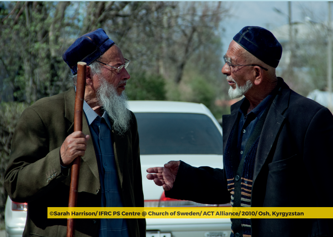
©Sarah Harrison/ IFRC PS Centre @ Church of Sweden/ ACT Alliance/ 2010/ Osh, Kyrgyzstan

During quarantine, where possible, safe communication channels should be provided to reduce loneliness and psychological isolation (e.g. WeChat).